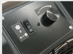
New MB50 variable speed controller