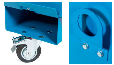
Forklift skids and lifting eyelets

Customer Order Line 01527 830610 Technical Advice 01527 395635 E: sales@broughtoneap.co.uk F: 01527 527558