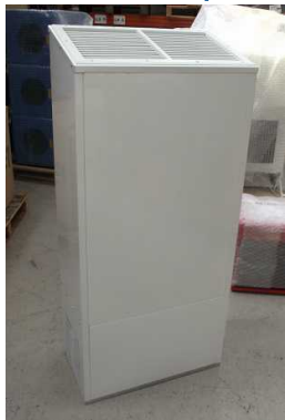
Tamper proof controls at rear of machine