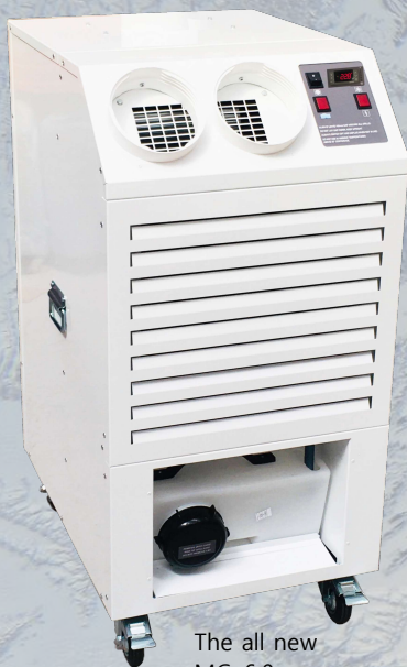
The all new MCE6.0

All new for this year is the digital thermostat that allows the user to set the desired temperature and sit back while the unit maintains it. Ideal for use either as a spot cooler or to help regulate temperatures wherever the need arises, the MCE6.0 is a fully portable powerhouse that ticks the environmental boxes.