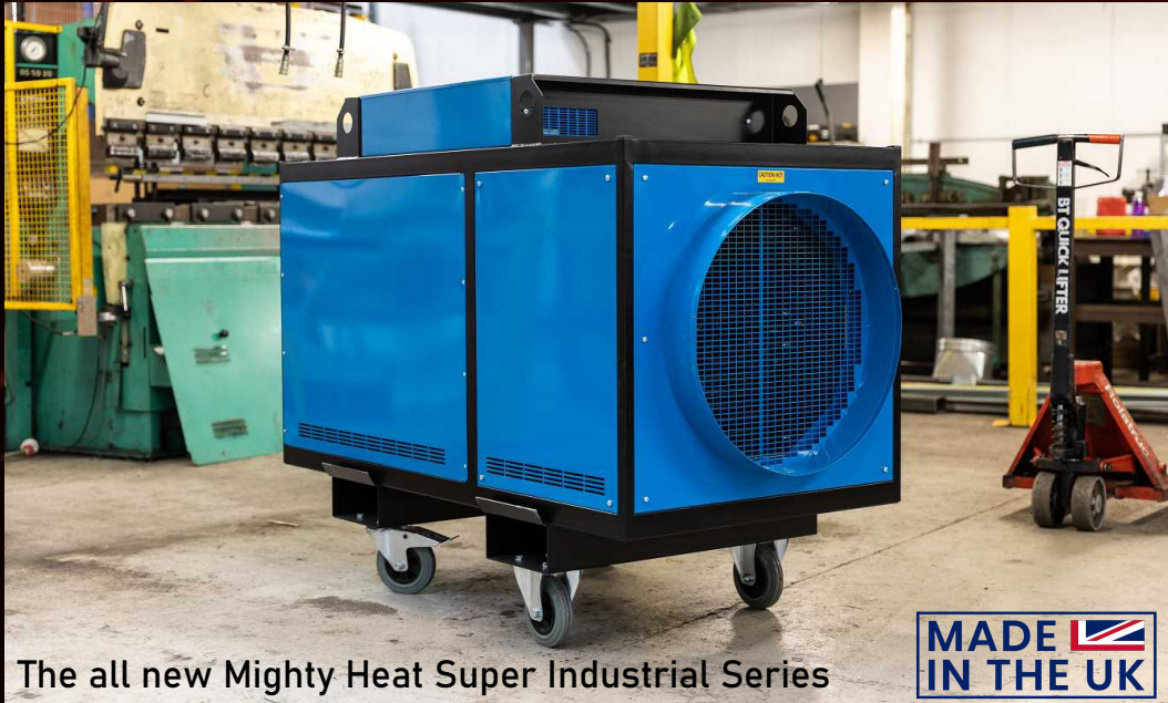
The all new Mighty Heat Super Industrial Series